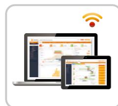
Internal WIFI & Remote Monitoring